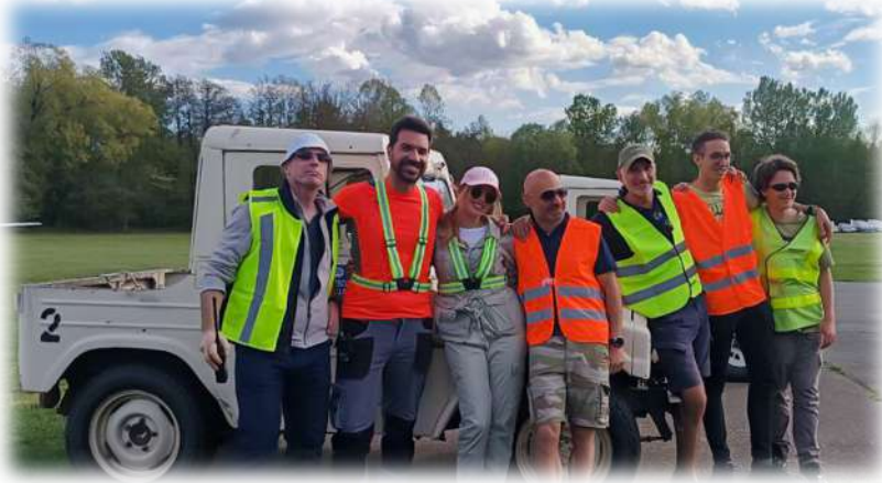
Grid staff engaged during SAP takeoffs and landings.

Since the first edition in 2008, the SAP has been designed, organized and conducted by Alberto Sironi with the indispensable support of about 20 collaborators, specialized in the different activities required: organization, promotion, office, tows, deployments, flight line, radio, lecturers and coaches, interpreter, weather forecast, task setting, scoring, bar, workshop, events, photo/video, communication, etc.