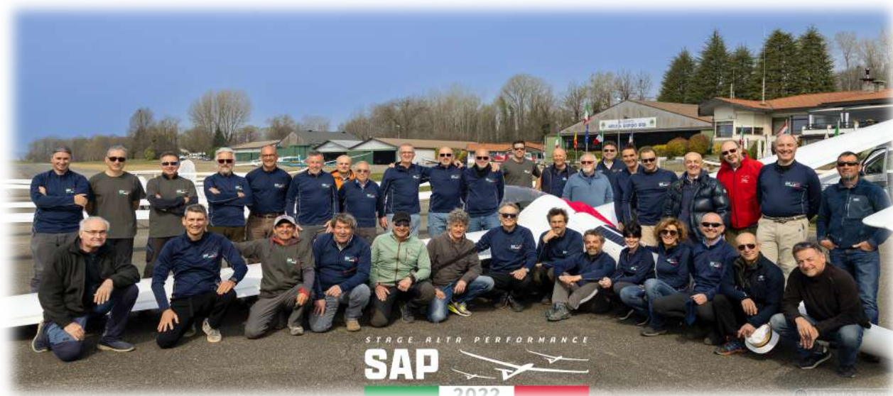
Piloti SAP 2022

The SAP is dedicated to Italian and foreign sport pilots of all levels equipped with a glider and a valid FAI card. However, participation in the SAP is recommended for pilots who have already achieved at least Silver badge and have good mountain flying experience (participation in other stages and/or competitions and at least 300 km flown in the mountains).